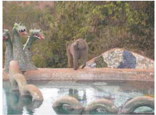
The mosaic pool at Kitengela with its fabulous sculptures. The baboons come to drink at twilight.