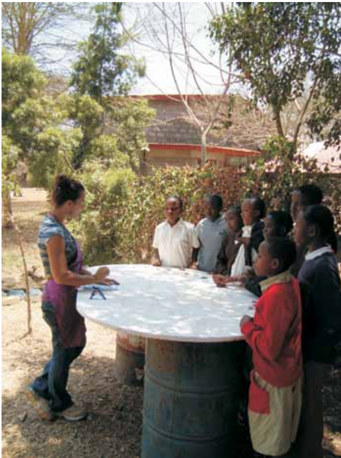
Day one: working with the students who ranged in age from 10 to 16. Here I am explaining how I used their drawings for inspiration. We also spent some time talking about tools and safety. The school arranged for the kids to come to work during their art class.