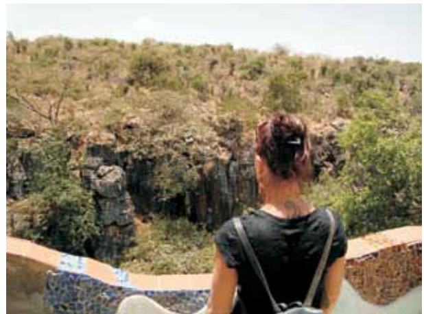
Setting off from Kitengela on the 2.5 mile commute to the Steiner School. That's the Nairobi National Park on the other side of the gorge.