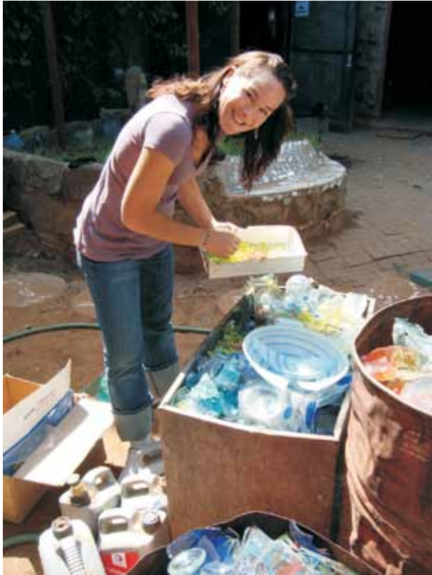
Sorting through Kitengela Glass recycling bins for materials to use in the Steiner School mural.