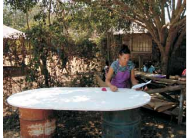
At work at the Steiner School after the mural's design has been approved by their college of teachers. Here I am transferring the mural's design to a prepared board.