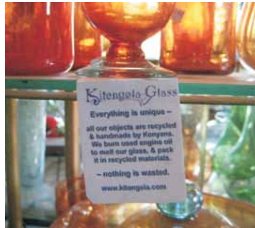
Kitengela's philosophy is: "Recycling everything, paying fair wages, protecting our environment." For our mural, we used 98% recycled materials- all donated by Kitengela