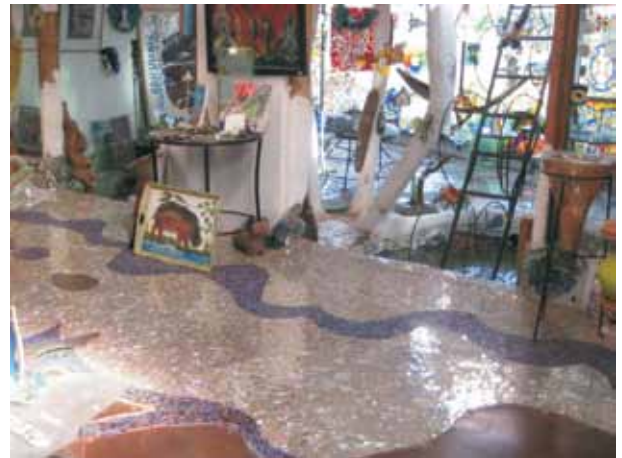
Mosaic floor in Kitengela Gallery by Nani Croze and Edith Nyambura. All recycled materials - glass made from melted-down bottles and discarded mirror and tile - were used in this mosaic.