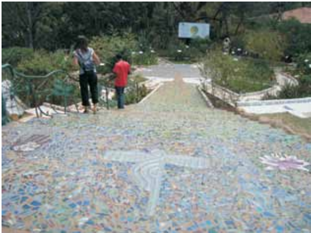
Recycled-glass mosaic plaza at Nairobi National Museum by Nani Croze and Kitengela Glass artists.

Laurel True has been traveling to Ghana, West Africa, for more than 20 years. Since 2001, she has been facilitating community mosaic projects with adults and youth in the town of Nungua, providing job training and art education to under-served communities. Long-term plans in Nungua include the development of a mosaic training academy and sculptural playground covered in mosaic. To learn more about these projects and how you might help, go to http://www.truemosaics.com/ghana.html .