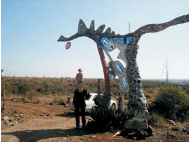
Arrival at Kitengela Glass after a long hour's drive over rocky dirt roads. Kitengela rises out of the red dust like an oasis.