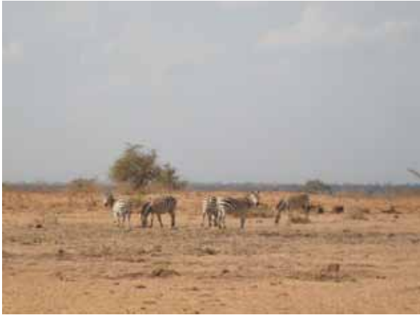
Every commute was a safari. In addition to zebra, we saw warthogs, impalas, antelopes, baboons, and even a giraffe.