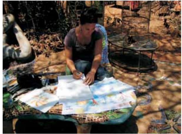
Working on the design for the mural using students' drawings of local flora and fauna as my inspiration. I used at least one element from each child's drawing in the mural design.