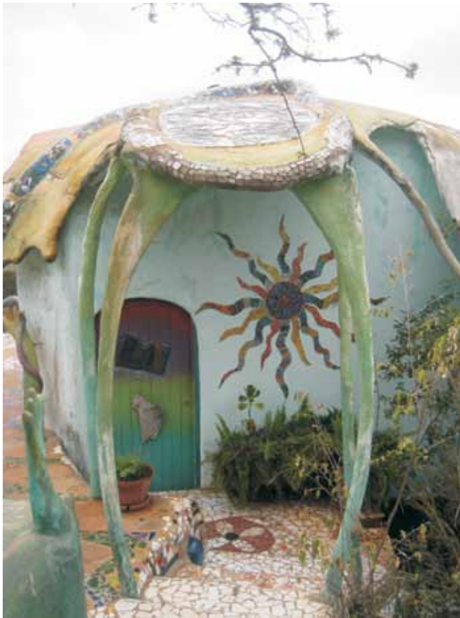
Buildings and mosaics by various Kitengela artists ...