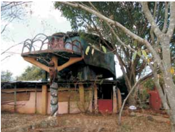
Our guesthouse. We called it our "Smurf House." It sits on the outskirts of Kitengela. Wonderful view of the plains, birds, and bush babies. And the site of the occasional leopard fight.